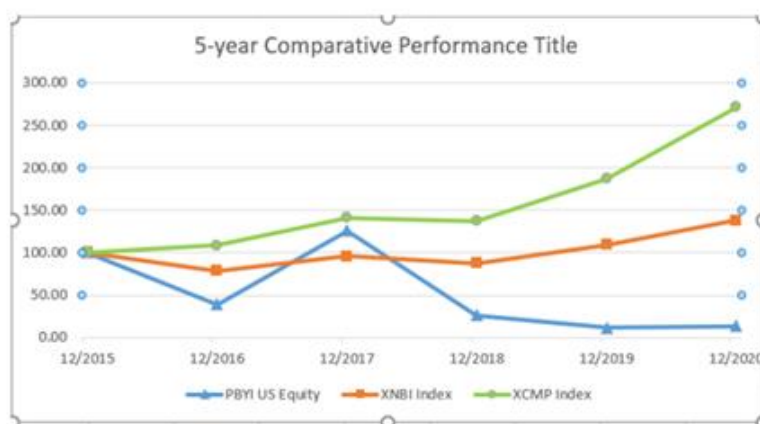
Cumulative Total Return Puma Biotechnology, Inc. Compared to the Nasdaq Biotechnology Index and Nasdaq Composite Index

The historical price performance included below is not necessarily indicative of future stock price performance.